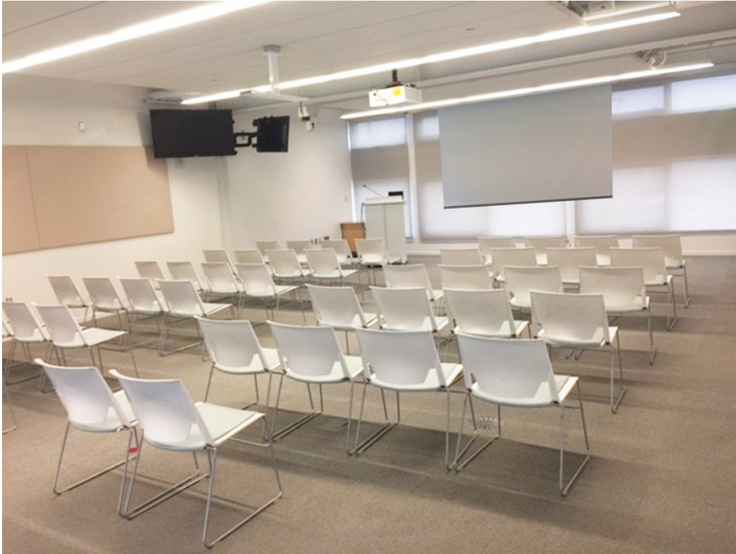
203 Theater Style - Max. 80 chairs

Room equipment: 40" inches screen TV connect to wall mounting facing south, 50" inches screen TV connect to wall mounting facing north, AV touch panel controller, data projector, projector screen, Local PC, Blu-ray DVD Player, phone line wired network connection (clear one), Phone line ready to be connect it (Polycom) stored in the cabinet, 6 ceiling speakers system, assistive listening system, wired camera (PTZ camera 360 degree), Mic connected to control stand, 2 wireless mic, large white board, Mobil document camera.