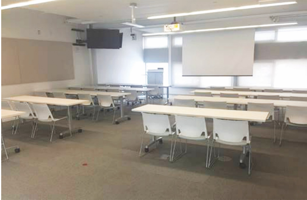
203 Classroom style - Max. 46 chairs without wheels and 16 tables