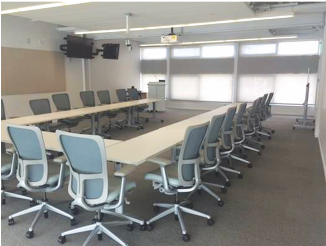
203 U-Shape Style - Max. 27 rolling chairs